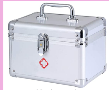
Medication Lock Box